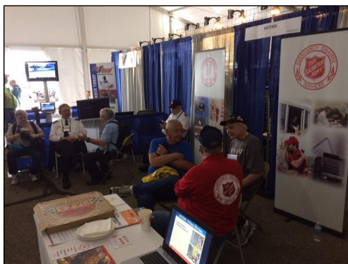
The 2018 Hamvention SATERN Booth with its display area (foreground) and Hospitality Area (background) became a popular spot people to stop and rest.

This year's SATERN booth was very different. For the first time, a double-size booth was reserved. Half of the booth was a traditional display booth with pamphlets, banners and a computerized convention display. The other half of the booth provided a large hospitality area with chairs, snacks, coffee and water so that visitors could sit, rest and talk.